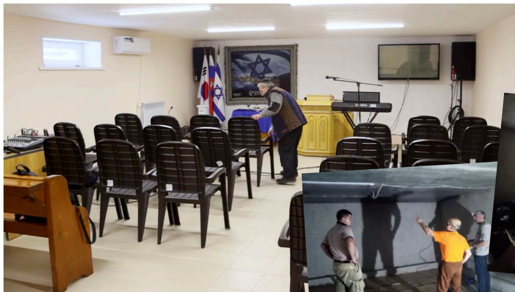
Before and after pictures of the renovated space.