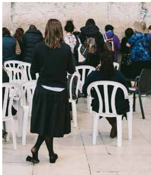
The women’s section for prayer at the Wailing Wall in Jerusalem

The Greek word used by Paul and translated as “first” is proton (πρῶτον). This term implies a priority rather than a sequential order of events.