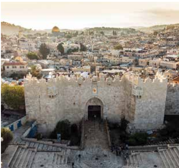
The Damascus Gate on the north side of the Old City of Jerusalem

Knowing the future plan of God, it is clear that the Church should somehow continue to prioritise Jewish evangelism, especially as we see the day of His second coming drawing near. Bringing the gospel to the Jewish people first should not be viewed as a priority of privilege but as a priority founded on the Lord’s strategy to heal a broken world.