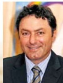
Executive Director of Celebrate Messiah Australia