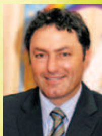
Executive Director of Celebrate Messiah Australia