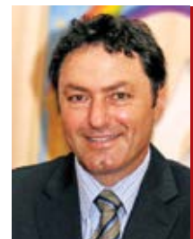
Executive Director of Celebrate Messiah Australia